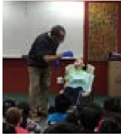
Dentists visited to teach students about the importance of dental health!