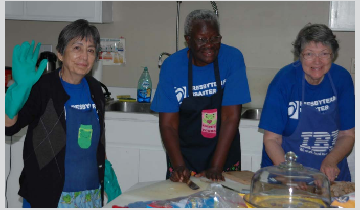
September 2016 Mission Trip

Help us reach our goal of collecting 7,000 items this year!