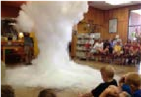
The Science Guys thrilled us with their Walloping Weather Unit!