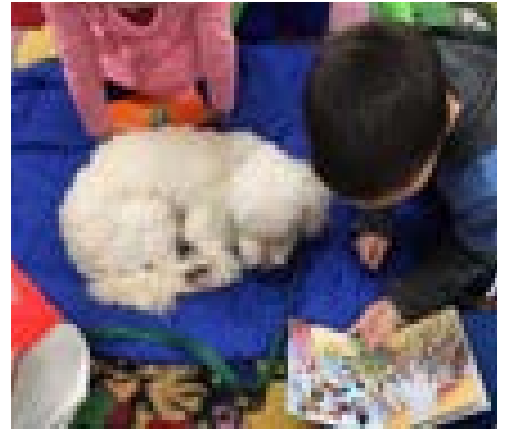
Many amazing pets came to visit during Pet Week! Students also watched a service dog get a checkup by a local veterinarian!

For information regarding registration dates, class choices, and tuition for 2018–2019 classes, please visit our website or call the school office and we will be happy to help you. We hope that you will join us on Facebook, where you can see pictures of our program and what we are up to each month! Happy Easter!