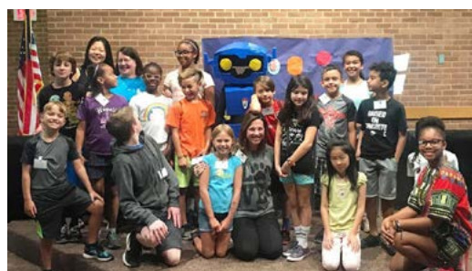
Vacation Bible School, July 2019