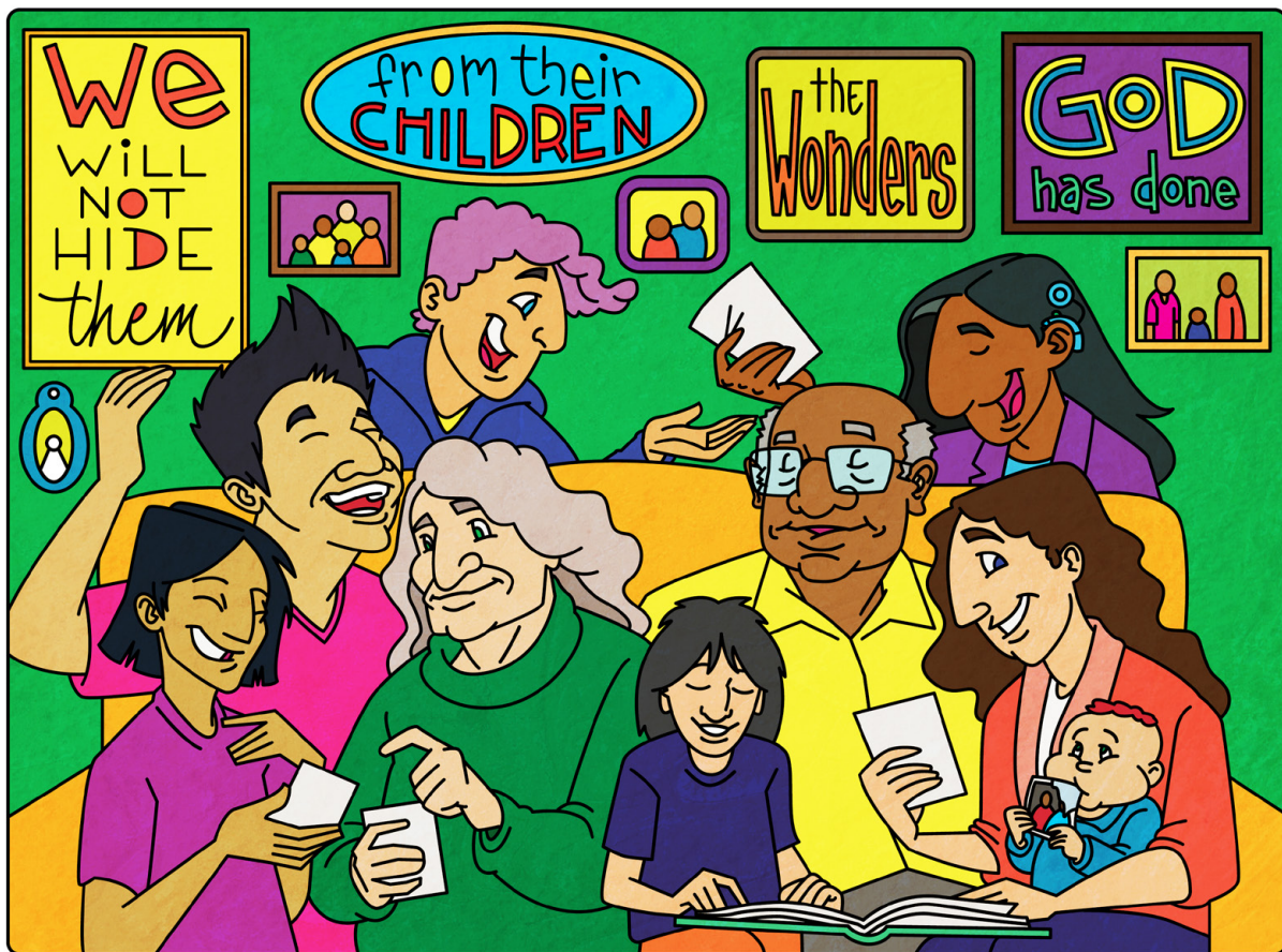
Psalm 78: 1-4 • illustratedministry.com